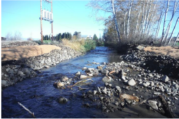
Correcting Fish Passage Barriers