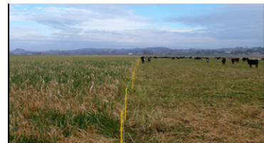
Figure 3. This cover crop mix (Boise, Id) produced over 13,000 pounds of dry matter per acre before grazing started. Notice the warm season species have frozen down but the cool season species in the mix are still actively growing. The stocking rate was 300 cows on 3 acres for one day. The producer used step in posts and one strand poly wire to set up paddocks. Portable water tanks were utilized.

Wyoming Natural Resources Conservation Service