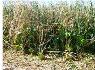
Figure 2. Multi-species cover crop mix planted August 10 th after wheat harvest in Boise, Idaho

If planned correctly cover crops can be a "win-win" option for producers, who understand and realize their potential to improve soil function and increase farm system diversity. Figures 2 and 3 below show cover crop diversity and a grazing system